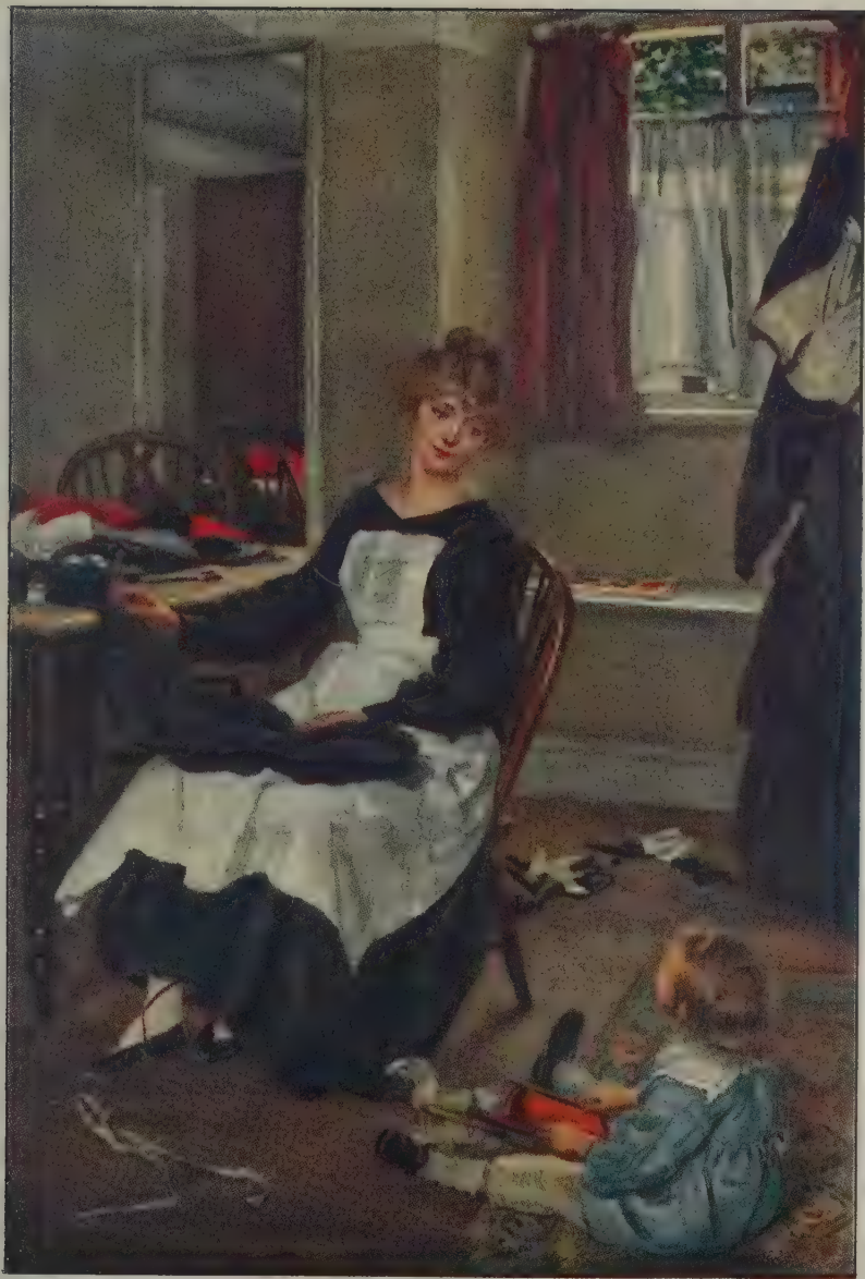
I SAW HER SITTING AT HER WORK